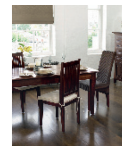
▲ Paper loom weave dining chair, £299 a pair, Marks & Spencer (0845 302 1234, mands.com)