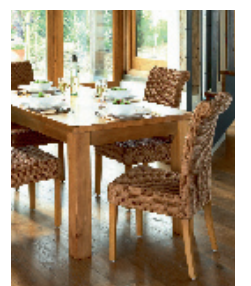
▲ Chiltern Maddelena pine dining chair with a natural weave finish, £225 a pair, Next (0844 844 8911, next.co.uk)