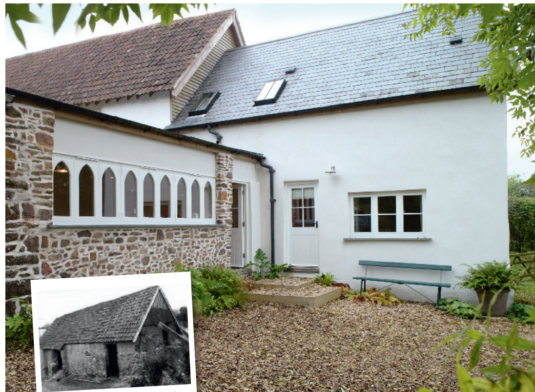
"This is the last outbuilding on the farm that we decided to convert"