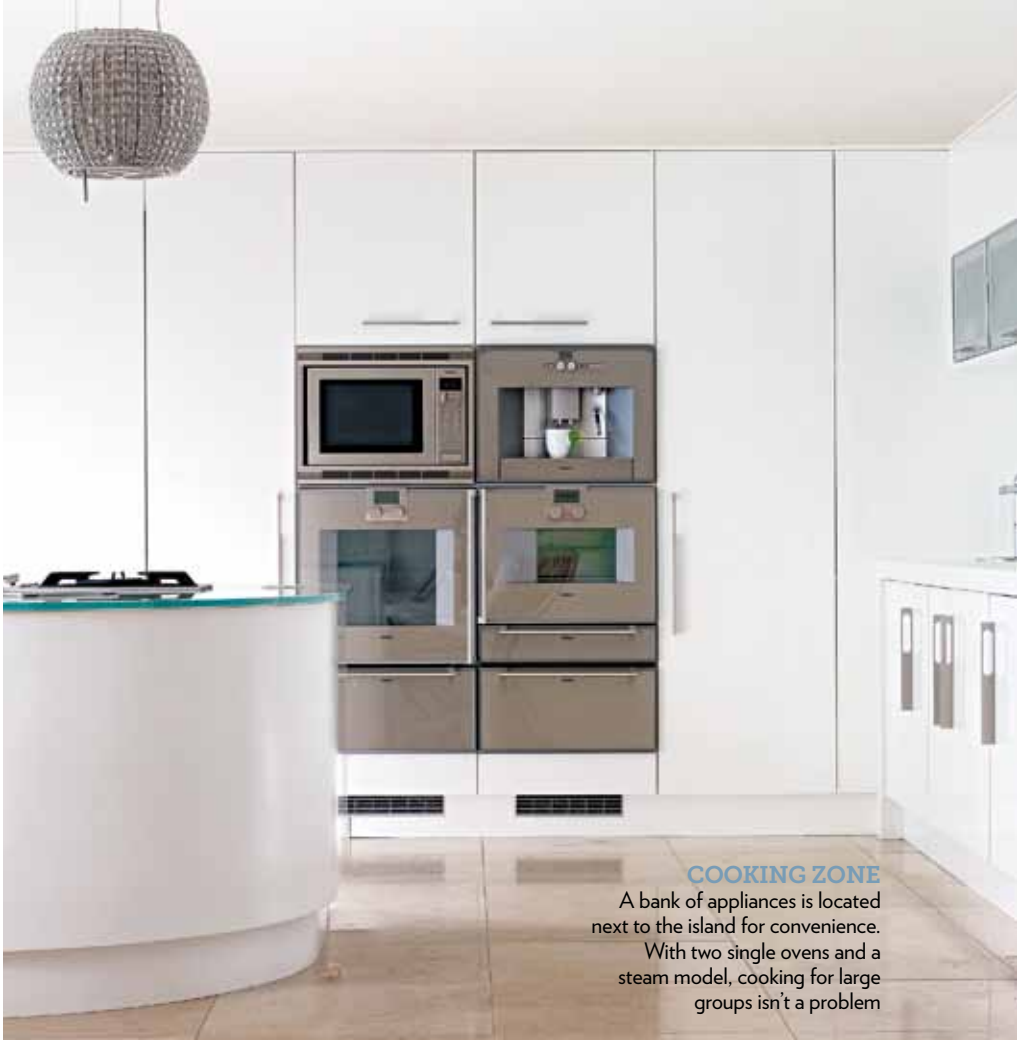
COOKING ZONE A bank of appliances is located next to the island for convenience. With two single ovens and a steam model, cooking for large groups isn't a problem

'The Zip hot and chilled, filtered water tap is our favourite purchase. It's ensured we never have to boil the kettle again'