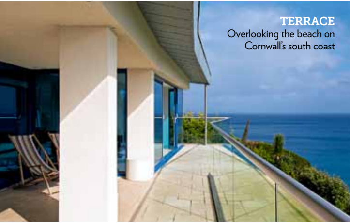
TERRACE Overlooking the beach on Cornwall’s south coast

FEATURE CLAIRE FULTON-RAY