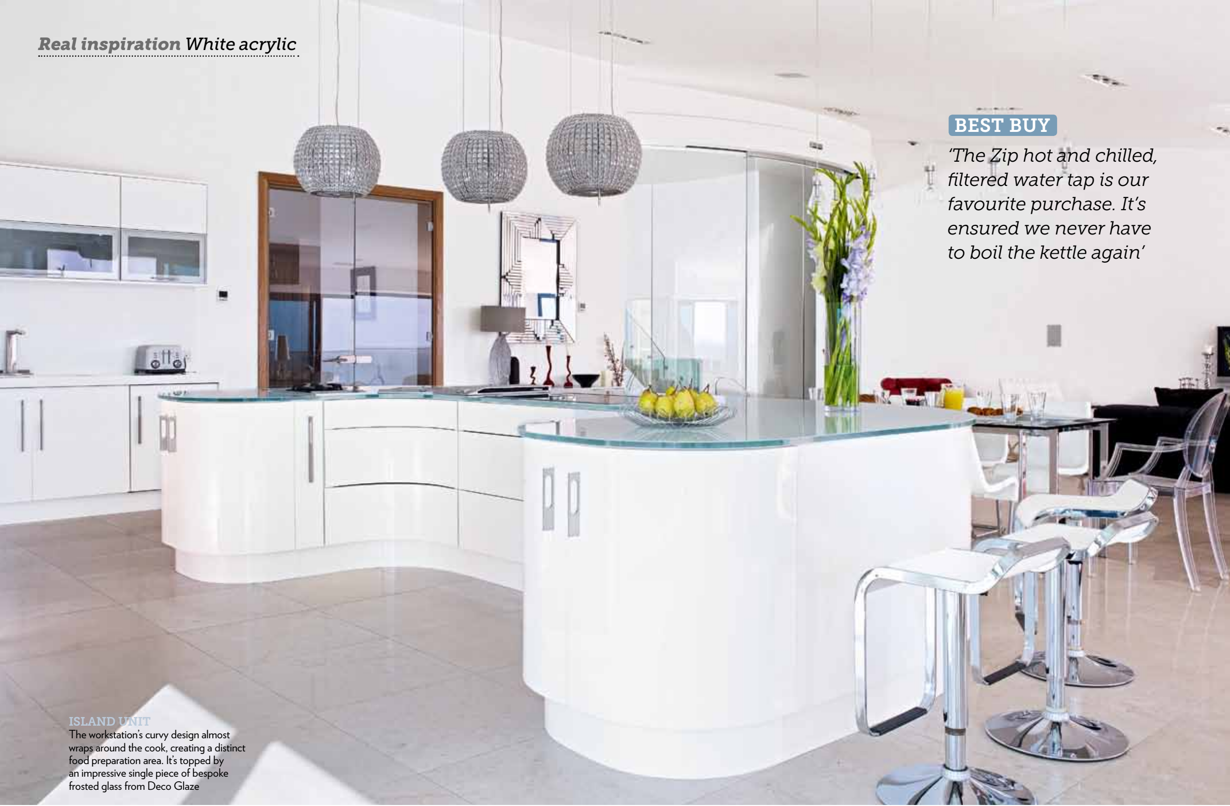
ISLAND UNIT The workstation's curvy design almost wraps around the cook, creating a distinct food preparation area. It's topped by an impressive single piece of bespoke frosted glass from Deco Glaze

'The Zip hot and chilled, filtered water tap is our favourite purchase. It's ensured we never have to boil the kettle again'