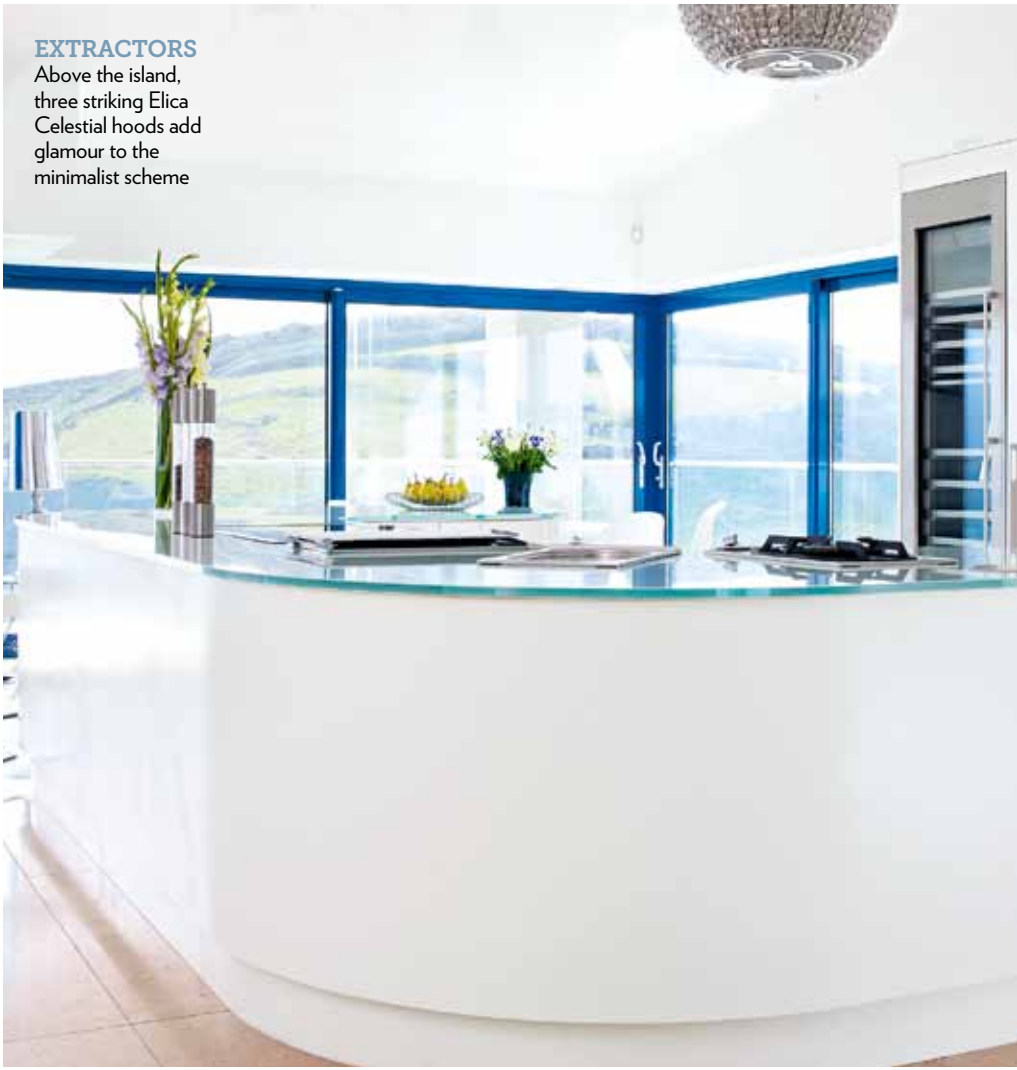
EXTRACTORS Above the island, three striking Elica Celestial hoods add glamour to the minimalist scheme