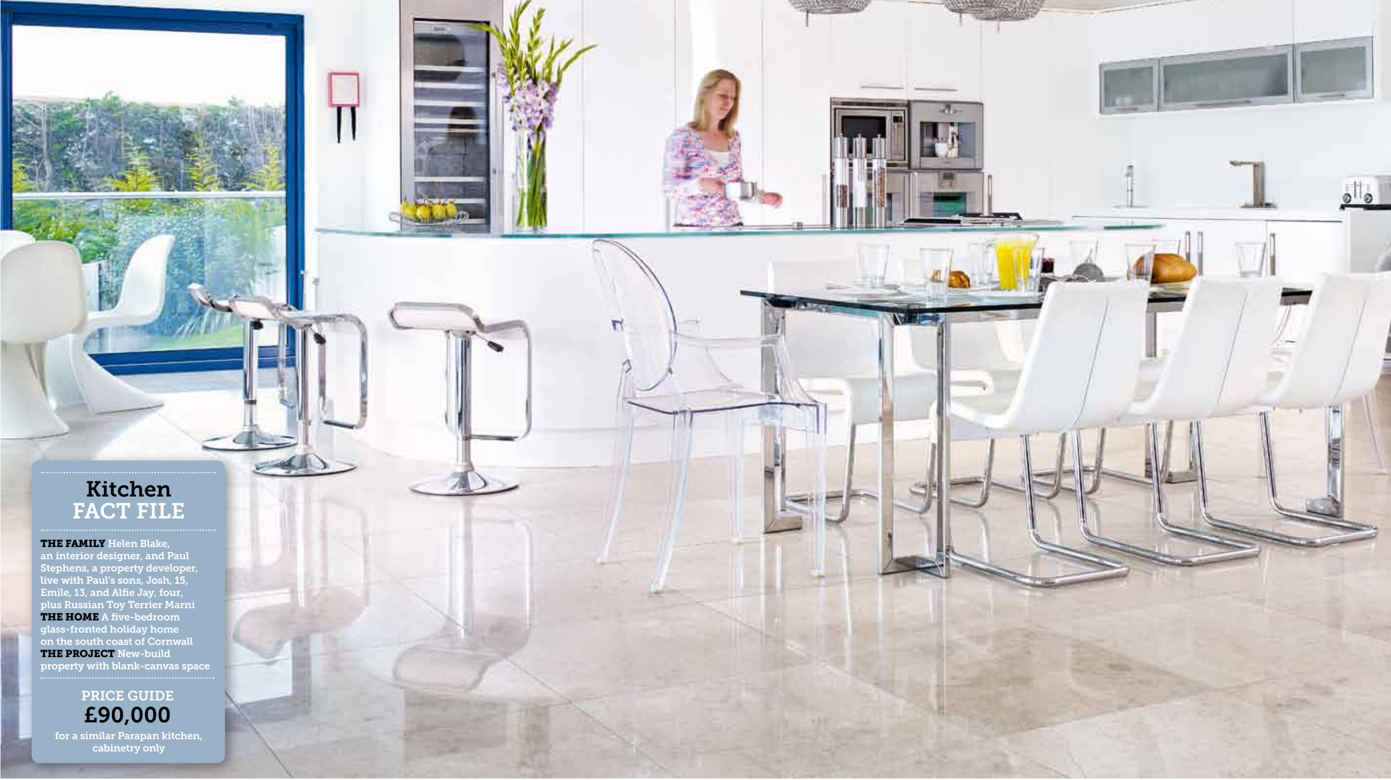
CABINETRY White Parapan was chosen for the wall units and island to create a contemporary scheme that doesn’t dominate the multifunctional living space. It’s matched with worktops in Glacier White Corian and glass