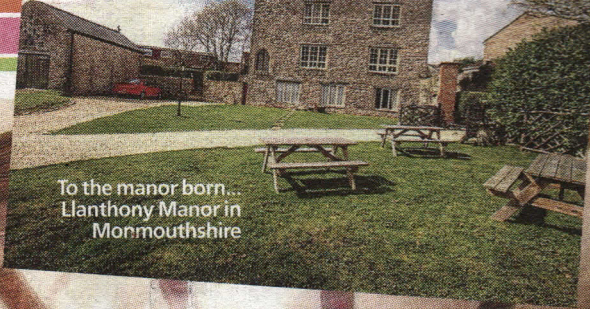
To the manor born... Llanthony Manor in Monmouthshire