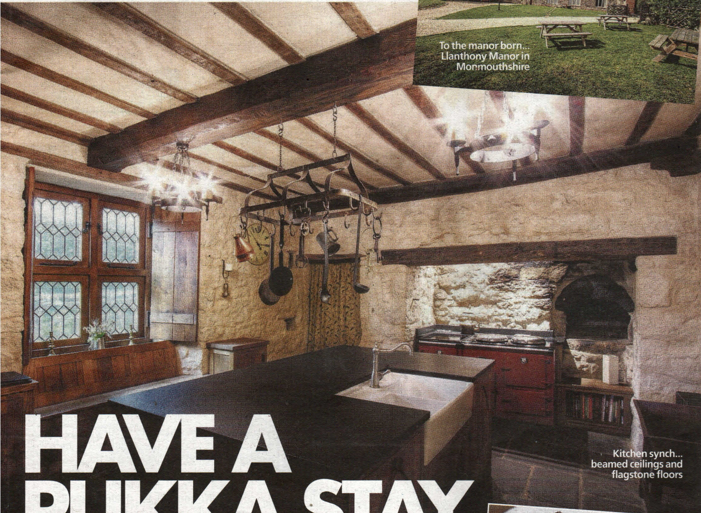
Kitchen synch... beamed ceilings and flagstone floors