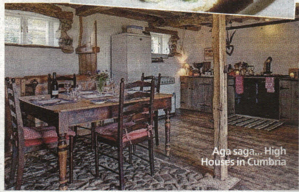
Aga saga... High Houses in Cumbria

Unique Homestays operates at the posh end of the market and the Herringbone