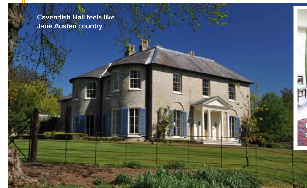
Cavendish Hall feels like Jane Austen country