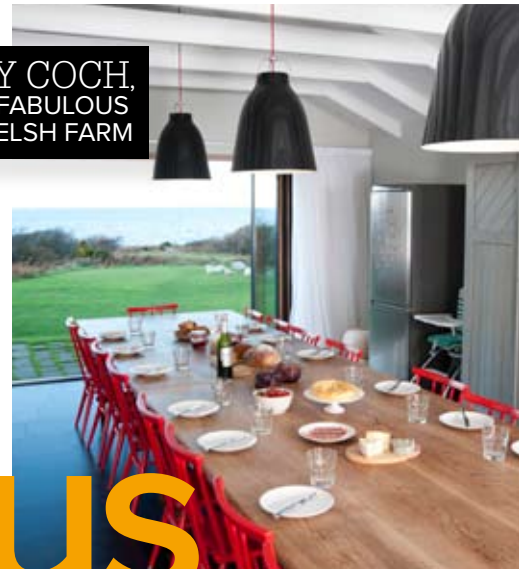
TY COCH, A FABULOUS WELSH FARM