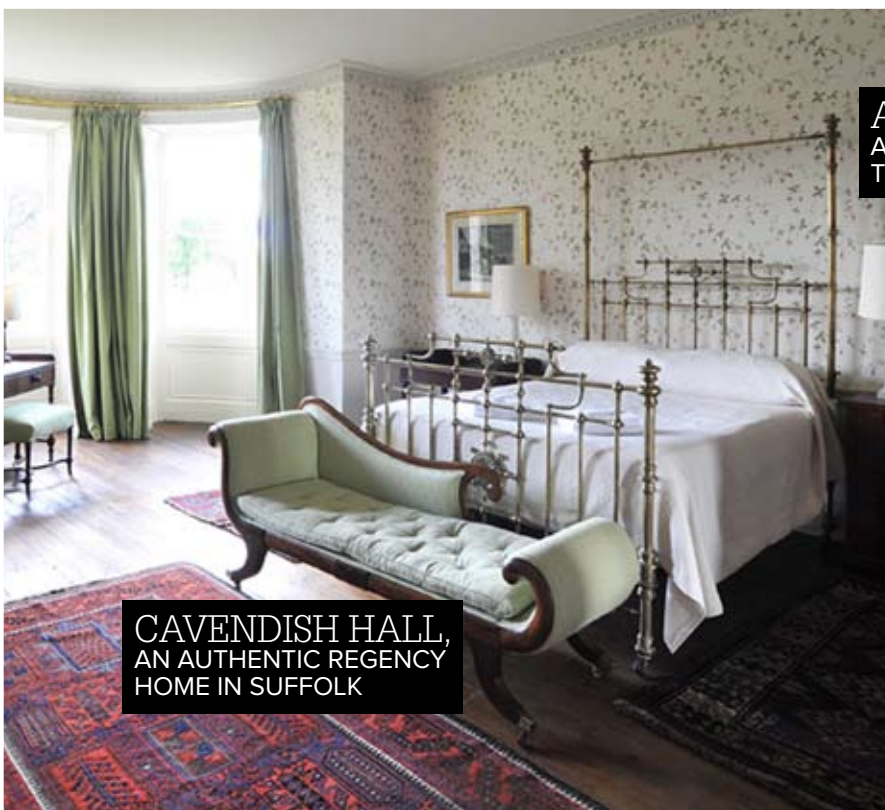
CAVENDISH HALL, AN AUTHENTIC REGENCY HOME IN SUFFOLK