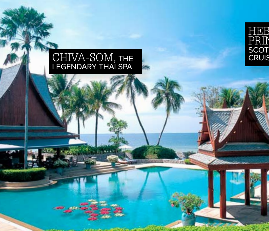
CHIVA-SOM, THE LEGENDARY THAI SPA