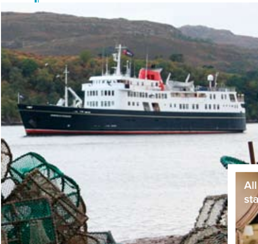
The Queen chartered the cruise ship for her 80th birthday

The Hebridean Princess is Scotland's ritziest cruise ship and its west-coast island sprees make a magical anniversary trip for two. ENJOY THE SPACE You'll feel you're in a floating five-star country house hotel. And with a crew-to-guest ratio of almost one to one, you're sure of good service.