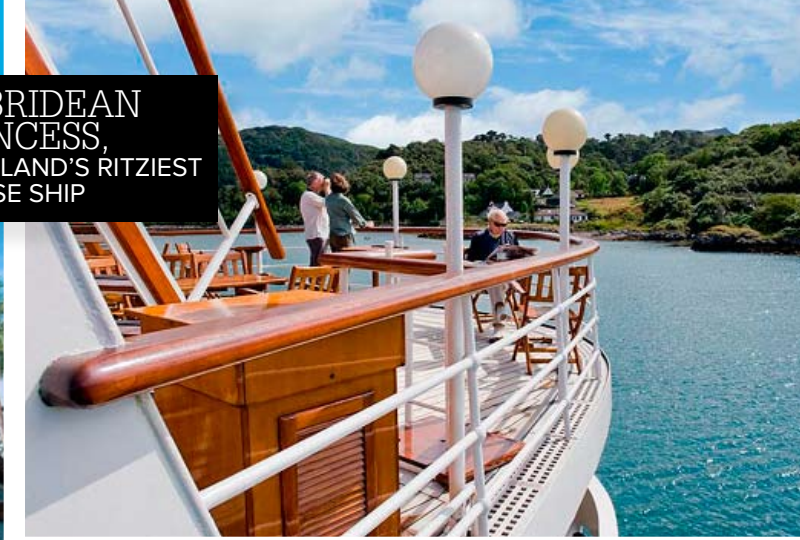
HEBRIDEAN PRINCESS, SCOTLAND'S RITZIEST CRUISE SHIP