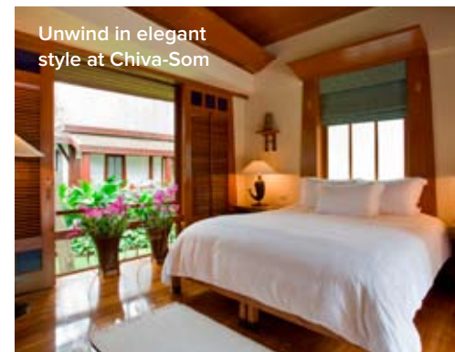
Unwind in elegant style at Chiva-Som

A pampering spa break at Chiva-Som in Hua Hin is perfect for a solo escape. ENJOY THE SPACE Serenity reigns in elegant, terraced rooms, and there are seven acres of tropical gardens, gazing out to the Gulf of Thailand. This is a holistic experience, so on arrival, you'll receive a wellness consultation. TO SEE, TO DO Don't treat the trip as a detox. You deserve the Spa Pampering package's feel-good menu of blissful daily massages, confidence-enhancing facials, manicures and pedicures. BIG NIGHT Though the atmosphere's peaceful, there's plenty of opportunity to make friends over evenings of gourmet Thai cuisine and glasses of chilled coconut milk. You may even encounter a Hollywood celeb or two! WHAT IT COSTS A seven-night Spa Pampering package costs from £3,775pp with W&O Travel (0845-2773310; wandotravel.com ), including meals, treatments, flights and transfers.