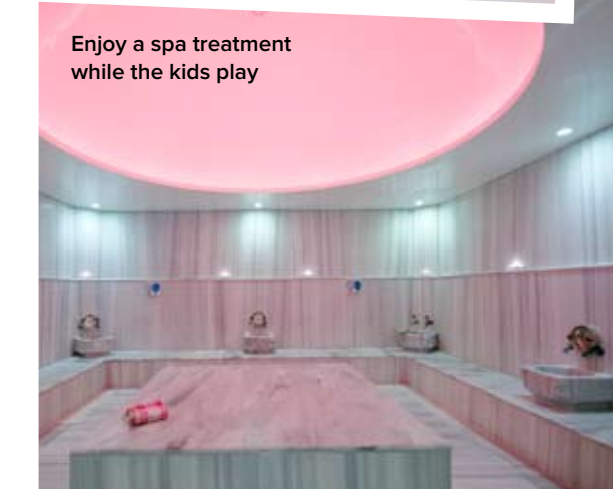
Enjoy a spa treatment while the kids play