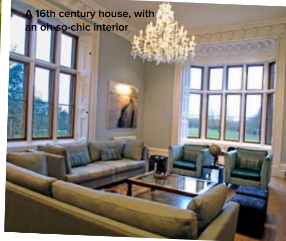
A 16th century house, with an oh-so-chic interior

When you have a group of 14 people, this stunning house costs just £186pp for three nights!