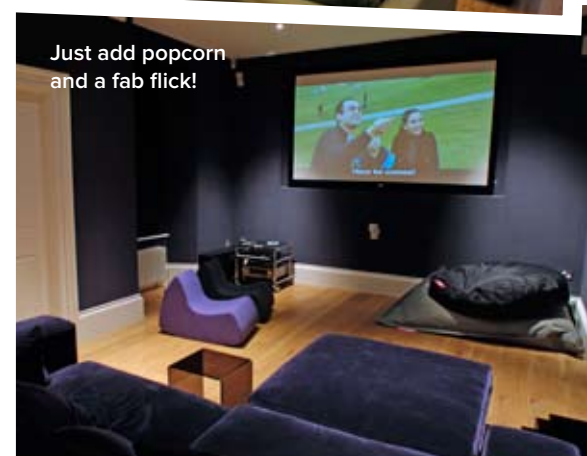
Just add popcorn and a fab flick!