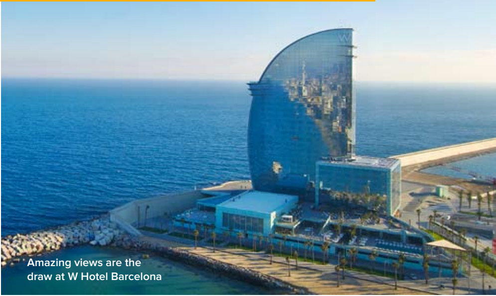
Amazing views are the draw at W Hotel Barcelona