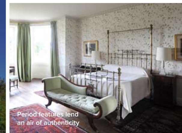
Period features lend an air of authenticity