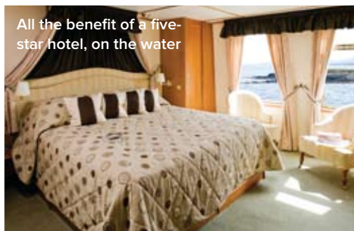
All the benefit of a five-star hotel, on the water

TO SEE, TO DO There's a whole string of themed cruises to choose from. How romantic is May's flower-themed trip, sailing from Oban, and drifting between gorgeous island gardens? BIG NIGHT Each evening is a fine dining, Champagne-flooded event. But for that special date, staff are a dab hand at rustling up a cake or chocolates – and can even arrange a private helicopter trip. WHAT IT COSTS From £3,320pp for seven nights full board (including drinks, tours and tips). Call 0800-0893929; prideofbritainhotels.com . Departs 3 May. + For 10% off an east-coast cruise, go to womanandhome.com ; click "Offers".