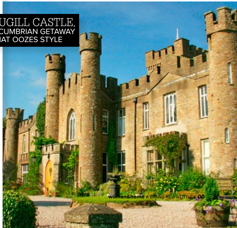
AUGILL CASTLE, A CUMBRIAN GETAWAY THAT OOZES STYLE