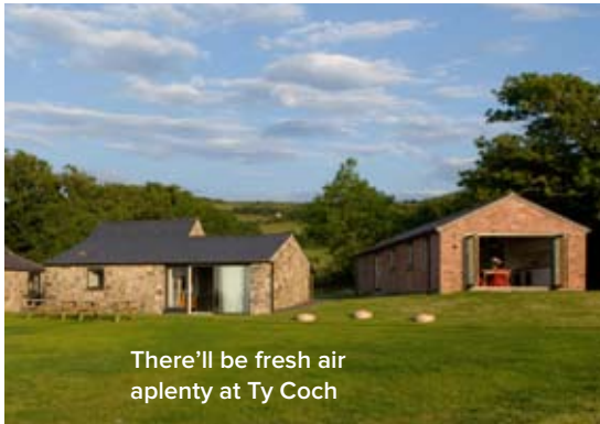
There'll be fresh air aplenty at Ty Coch