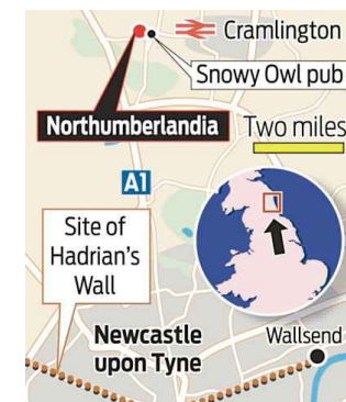
MAP OS EXPLORER 316

EATING AND DRINKING I took a packed lunch. A cart near the car park sells hot drinks and snacks. Cramlington's Snowy Owl pub has hearty meals.