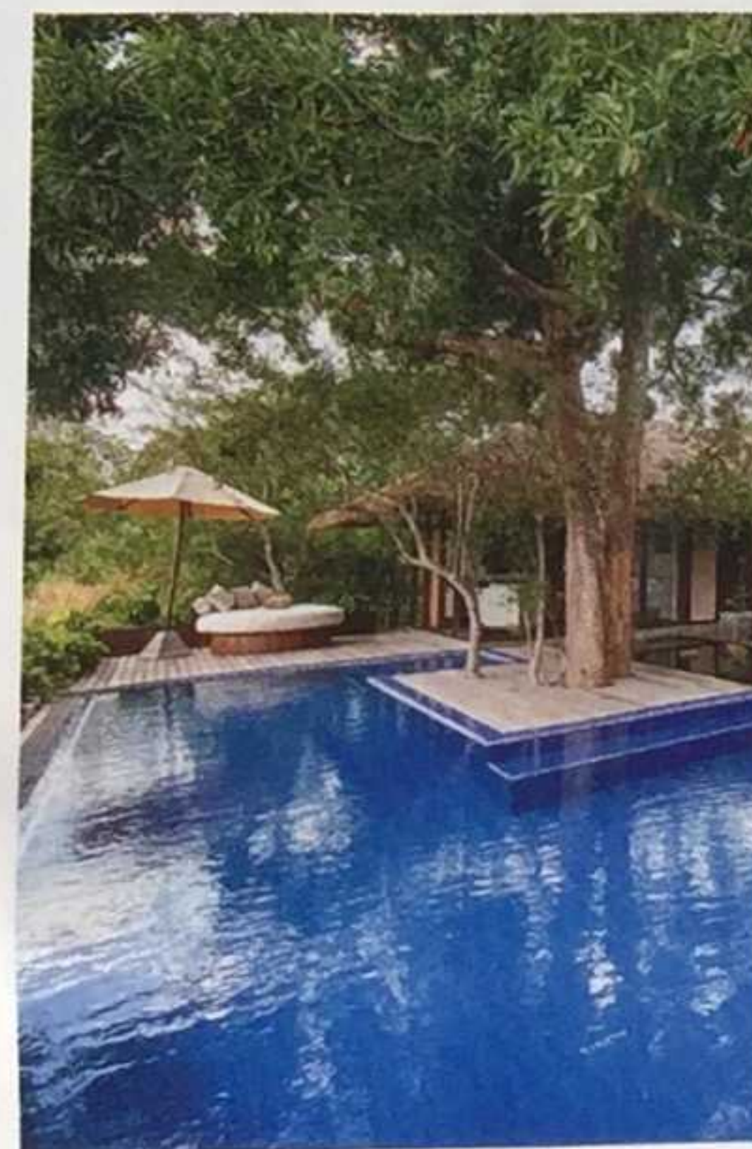
Indulge in a villa with a private pool (above), relax in Ulagalla's spa and dine on fresh local organic produce (right)

Sri Lanka In Style offers six nights at Ulagalla and one night at Residence by Uga Escapes in Colombo from £2,915. Price includes return flights from London, plus transfers, and is based on two sharing a double room on a B&B basis. Visit srilankainstyle.com