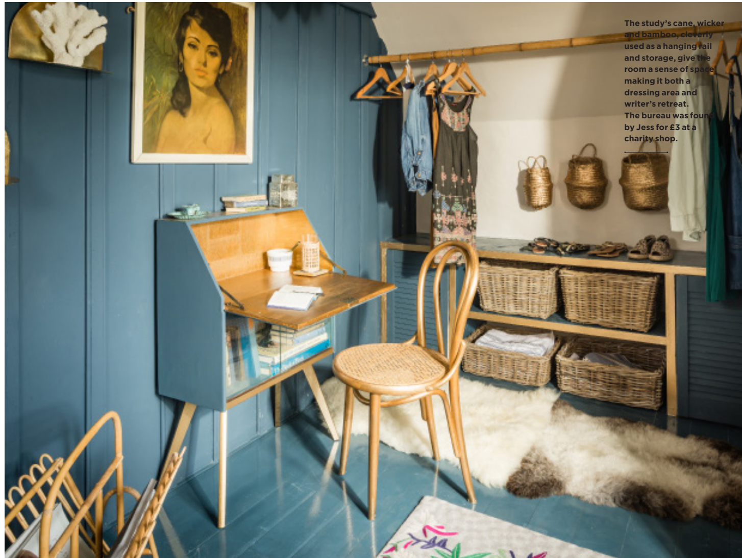
The study's cane, wicker and bamboo, cleverly used as a hanging rail and storage, give the room a sense of space making it both a dressing area and writer's retreat. The bureau was found by Jess for £3 at a charity shop.

Less is More If you're decorating a small space, don't be tempted to squeeze in too much furniture. Follow Jess's example and include a few stylish, statement pieces rather than a large quantity of less exciting items. That way, your rooms will feel bigger and the interesting elements will have plenty of space to shine. Look for furniture with small proportions and try to choose pieces you can see underneath - the more floor that's visible, the bigger a room will feel.