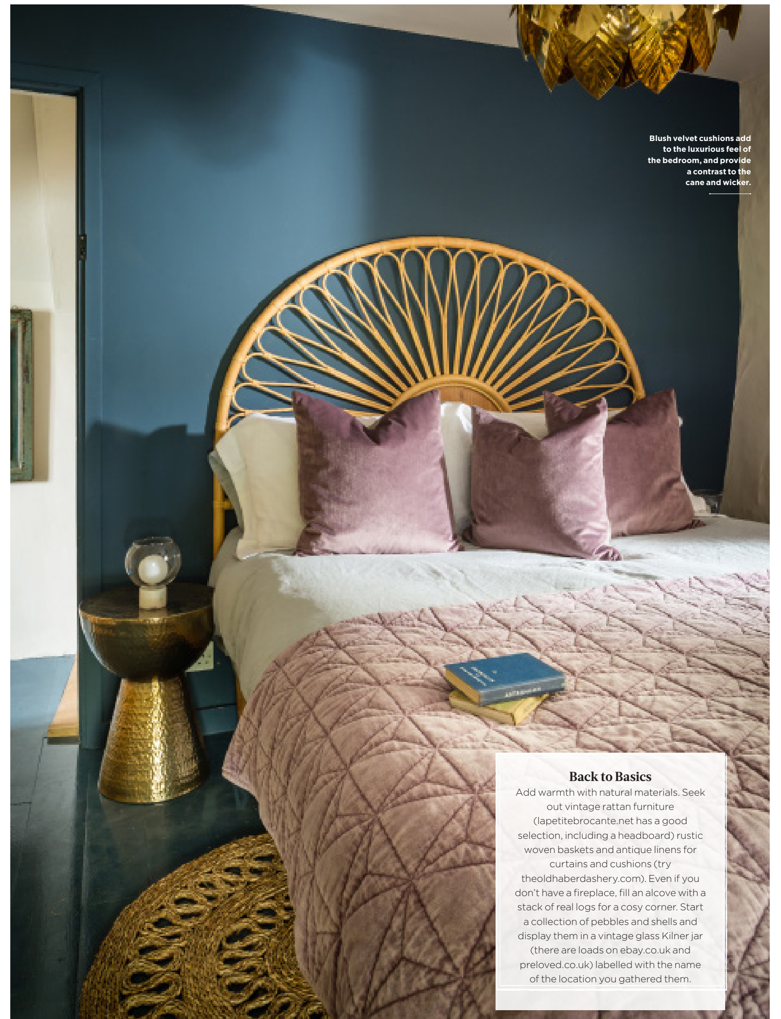
Blush velvet cushions add to the luxurious feel of the bedroom, and provide a contrast to the cane and wicker.

One of the reasons that Siren Cottage feels so welcoming is because every room contains natural materials. There are simple, wooden floorboards, exposed beams and lots of accessories in rattan and bamboo. Sheepskin rugs, a wicker basket filled with logs and linen blinds bring extra warmth to the scheme, while 'found' objects such as coral are elevated to the status of art. 'I picked up some seaweed on the beach and pressed it, then framed it in glass picture frames,' says Jess. 'I like to reference the local area in the décor - the beach is just a two-minute walk from the cottage.' Guests who stay at the cottage obviously find the setting inspiring as they have started a collection of pebbles and shells in the upstairs study.