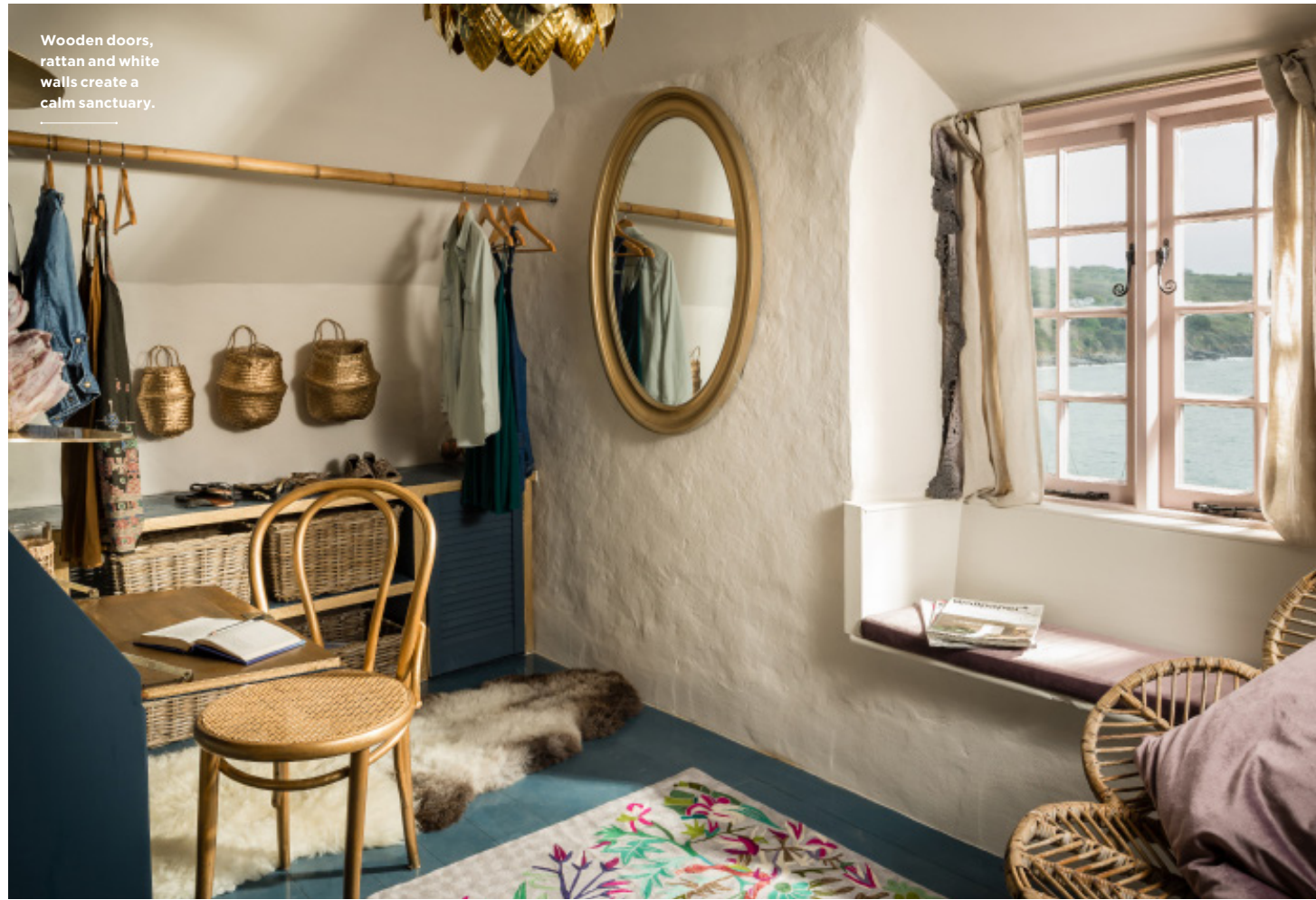
Wooden doors, rattan and white walls create a calm sanctuary.