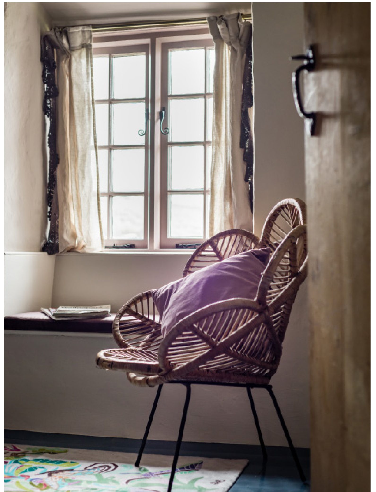
(opposite page) A shapely wicker chair by the window creates an inspiring reading corner.