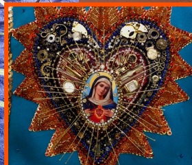
INTRICATE ART From discarded finds