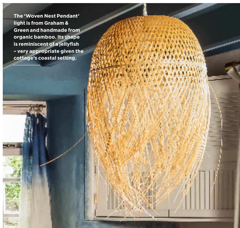
The 'Woven Nest Pendant' light is from Graham & Green and handmade from organic bamboo. Its shape is reminiscent of a jellyfish - very appropriate given the cottage's coastal setting.