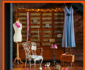
STYLING WITH STORY Salvage + vintage

IN THE KNOW: THE BEST COURSES, FAIRS, SHOPS & SHOWS