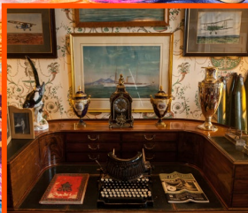
ROYAL GRANDEUR Woburn Abbey